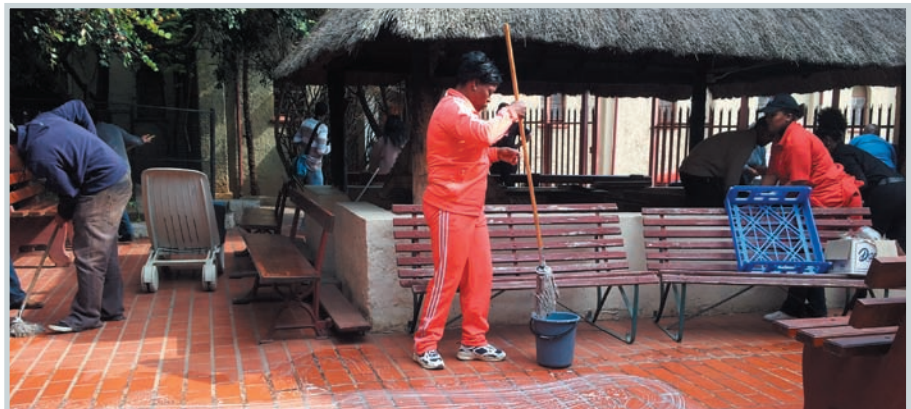
Hands on: 67 minutes of staff cleaning the home

The SAHRC's mandate is to ensure that the rights of all South Africans, including older persons are protected; the commission further stretched a giving hand by donating furniture to the Itlokomeleg Association for the aged in Alexandra. The home caters for old aged and persons with disabilities. Itlokomeleg, meaning help yourself, was conceived in 1978 by a group of concerned women in Alexandra community.